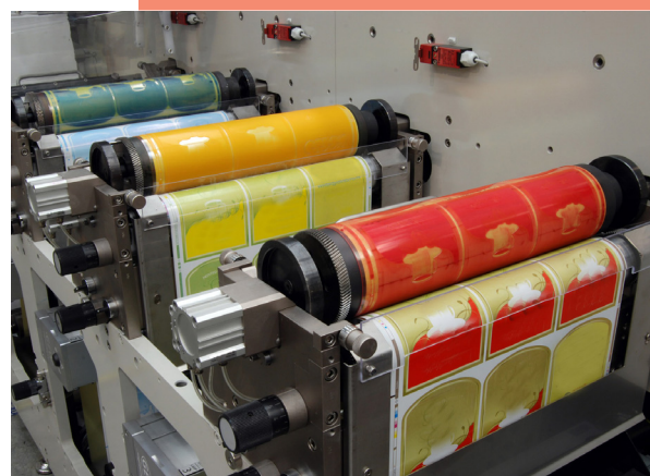
Inks for Flexographic Printing

Jaylink can be easily incorporated into a formula by dispersing it in a monomer that has strong solvency. Up to 30% of this additive can be dissolved in most acetate and ketone solvents. Jaylink is also soluble in acrylate monomers such as IBOA, NNDMA, NVP, EOEDA, TMPTA, GPTA, PONPGDA, HDDA and TPGDA.